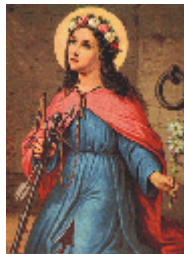
St. Philomena, Patroness of the Living Rosary,

Together, as a community, let us pray for peace in our world, in our loves, and for whatever special intentions we hold in our hearts.