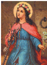
St. Philomena, Patroness of the Living Rosary,

Together, as a community, let us pray for peace in our world, in our loves, and for whatever special intentions we hold in our hearts.