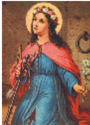
St. Philomena, Patroness of the Living Rosary,

Together, as a community, let us pray for peace in our world, in our loves, and for whatever special intentions we hold in our hearts.